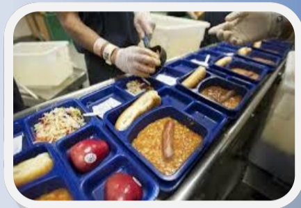
Right to a Balanced Diet and Water