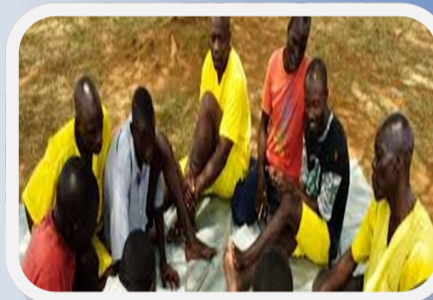
Right to Religious Worship, Exercise and Sports