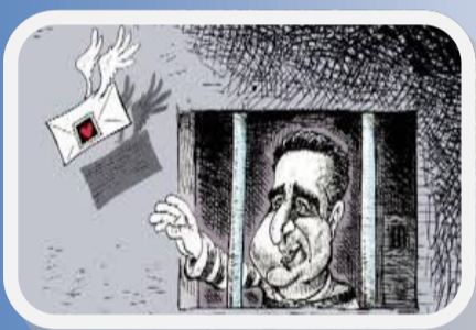
Right to Access Lawyers and the Outside World