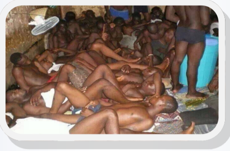
Right to Adequate Accommodation

Adopted by the First United Nations Congress on the Prevention of Crime and the Treatment of Offenders, held at Geneva in 1955, and Approved by the Economic and Social Council by its Resolutions 663 C (XXIV) of 31 July 1957 and 2076 (LXII) of 13 May 1977