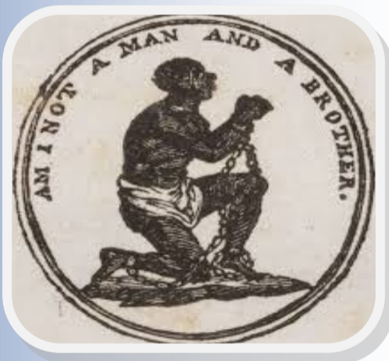
Right to Physical and Moral Integrity

Let's Advocate for the Rights of Inmates in Cameroon. One signature = One Voice!