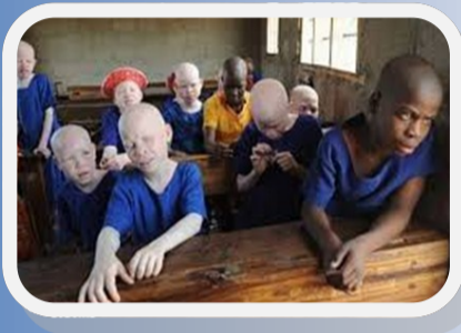
Right to Education and Training