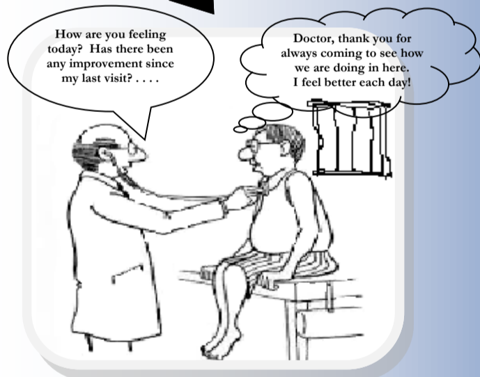
Right to Adequate Medical Facilities /Services