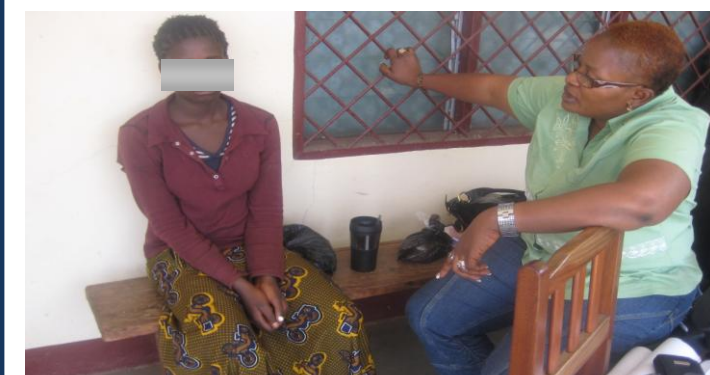
The coordinator of JPC with a victim of trafficking

*Collaborating with the Judiciary and the Forces of Law and Order to ensure the prosecution of traffickers under the law No. 2005/015 of 29 December 2005 relating to the fight against Child Trafficking and Slavery and Section 293 of the Penal Code.